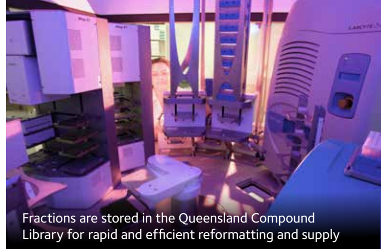
Fractions are stored in the Queensland Compound Library for rapid and efficient reformatting and supply