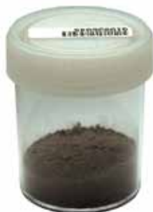
Biota 45,000 Samples