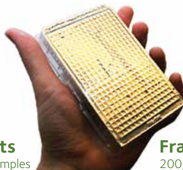
Fractions 200,000 Samples