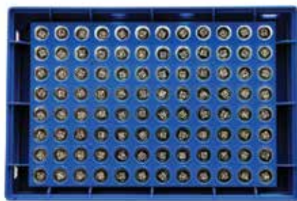
Extracts 17,000 Samples